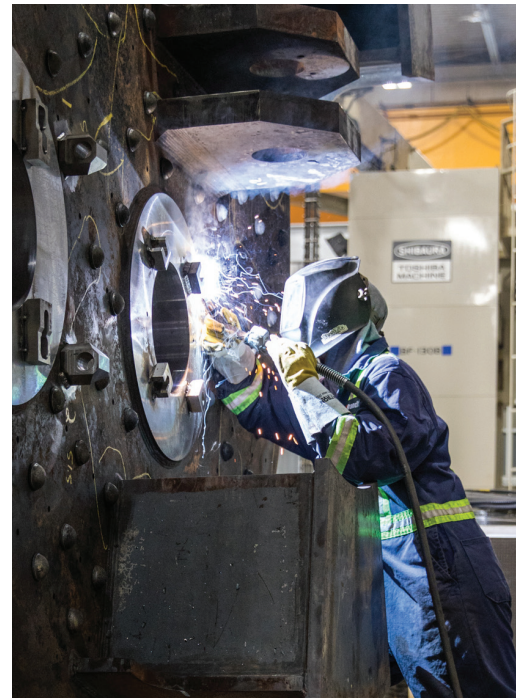
Sub Arc Welding