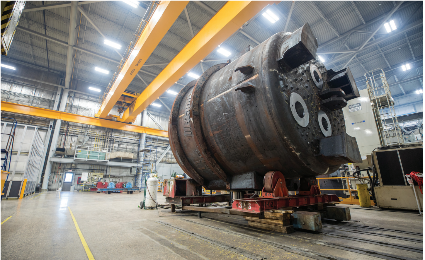
Trunnion Pin Installation