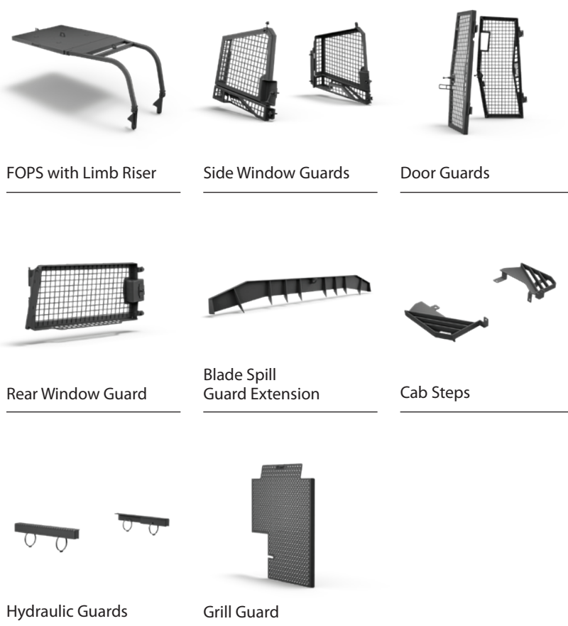
FOPS with Limb Riser