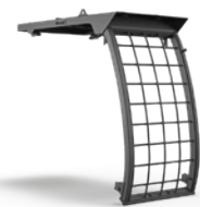
Falling Object Guarding (FOG)