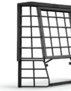
Front Hinged Window Guard