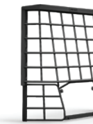
Front Window Guard