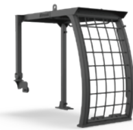
Falling Object Protective Structures (FOPS)