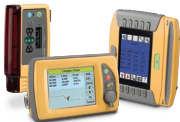
X62/X42 Excavator Indicate Systems

With Topcon's 2D systems, work faster, with more consistency, and higher accuracy, while significantly increasing safety by keeping the grade checker out of the trench. That's Topcon innovation. It's time.