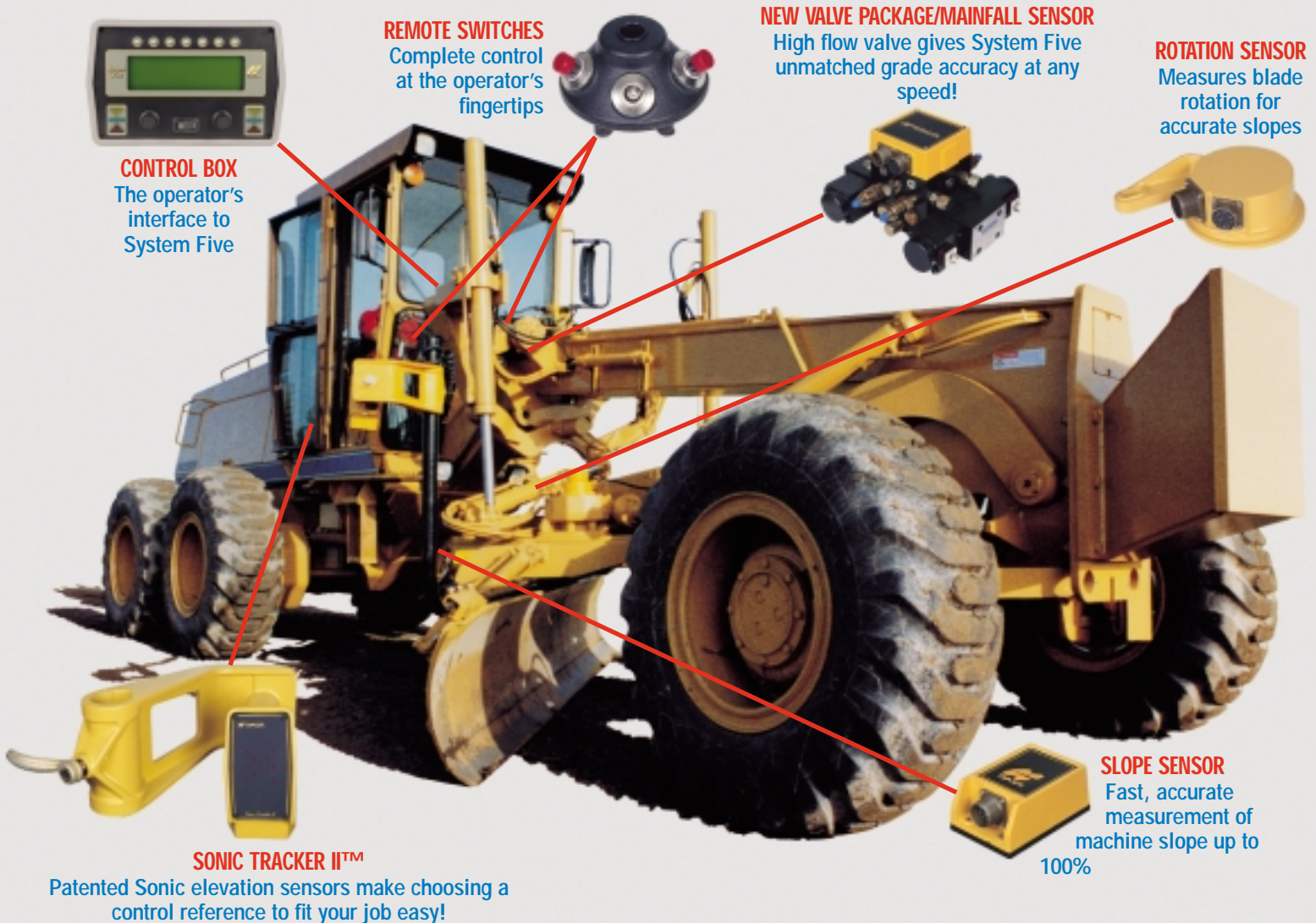
CONTROL BOX The operator's interface to System Five