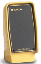
Sonic Tracker II

If you are looking to increase the speed at which you can grade, tighten your tolerances to save on materials and reduce the fuel burned and wear and tear on your motorgrader, 3D-MC² is exactly what you need!