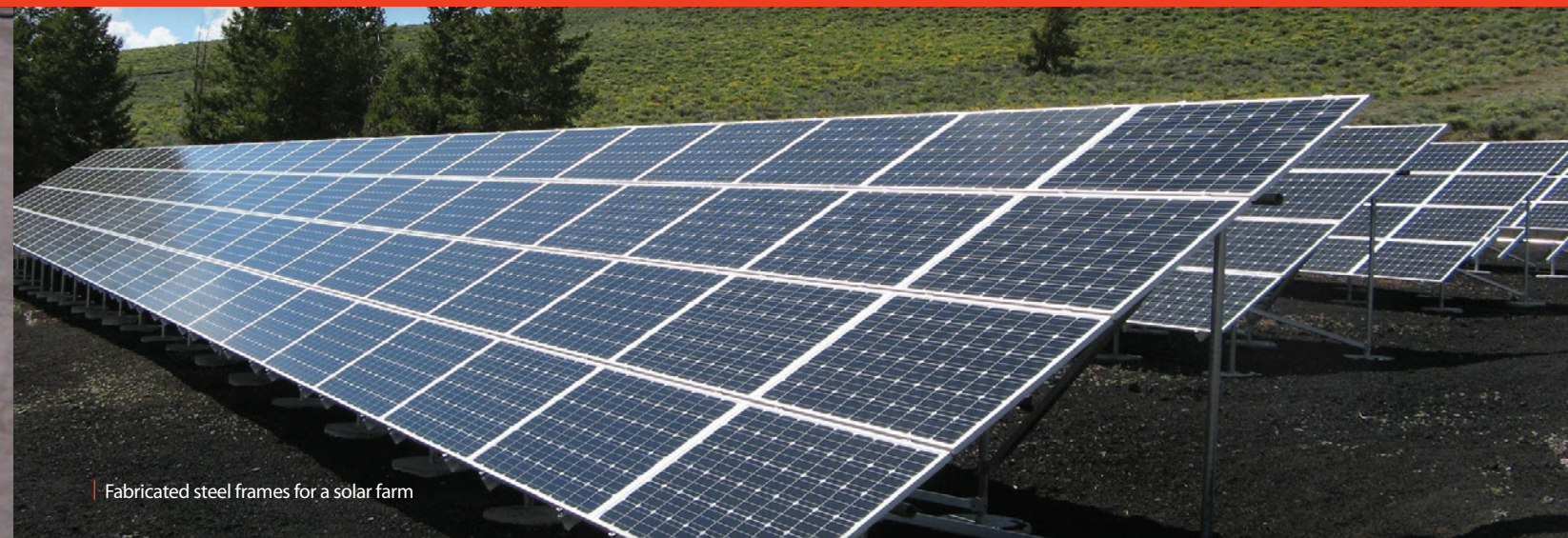
Fabricated steel frames for a solar farm

Brandt’s long history in manufacturing and engineering consulting make us the perfect partner for renewable energy projects.