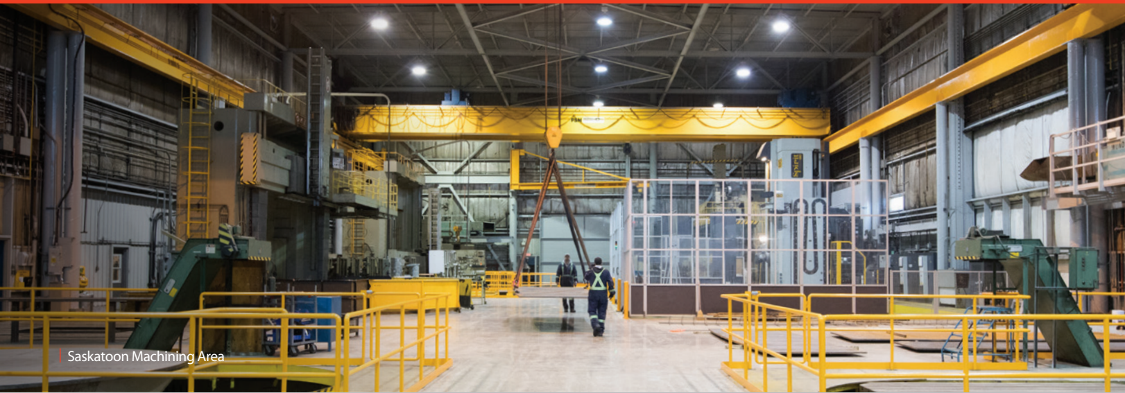
Saskatoon Machining Area