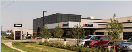
Regina, CAN (200,000 sq/ft on 38 acres)