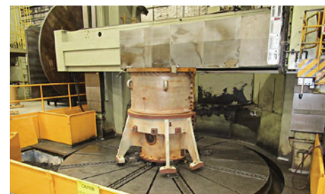
Brandt refurbished casings

The Brandt team collaborates with customers to assess opportunities and unique challenges, providing the full support that they need to deliver reliable, productive service.