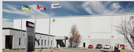
Saskatoon, CAN (210,000 sq/ft on 22 acres)