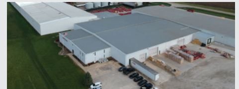
Bloomington, USA (196,000 sq/ft on 45 acres)